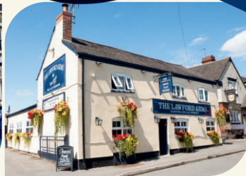
The Lawford Arms

13 Main Street, Long Lawford, Warwickshire, CV23 9AY