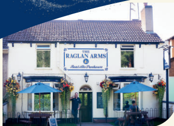
The Raglan Arms

50 Dunchurch Road, Rugby, Warwickshire, CV22 6AD